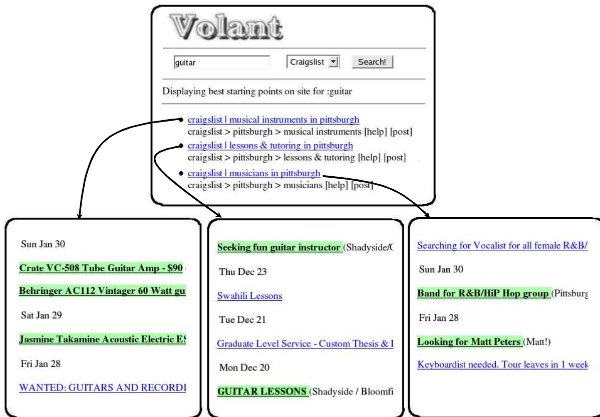
Figure 1: Screenshots of our prototype navigation-aided retrieval system, for query “guitar” over Craigslist Pittsburgh.

starting points are hypertext documents that, while they may not match the user’s query directly, permit easy navigation to many documents that do match the query, via one or more outgoing hyperlink paths (our starting points differ from Kleinberg’s “hubs”; see Section 2.1).